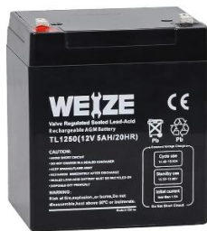
Example 12V 5AH SLA rechargeable battery

Shown above is the WEIZE TL1250 with dimensions 3.94 x 3.54 x 2.80 Inches. Similar size 12V batteries with 3/16 spade terminals (f1) for Home Alarms, UPS Systems and Electric Scooters will work as well. To avoid damage to the Mini Thumper, do NOT create your own power cables. Do not attempt to charge the battery until it is COMPLETELY disconnected, and removed from the Mini Thumper!